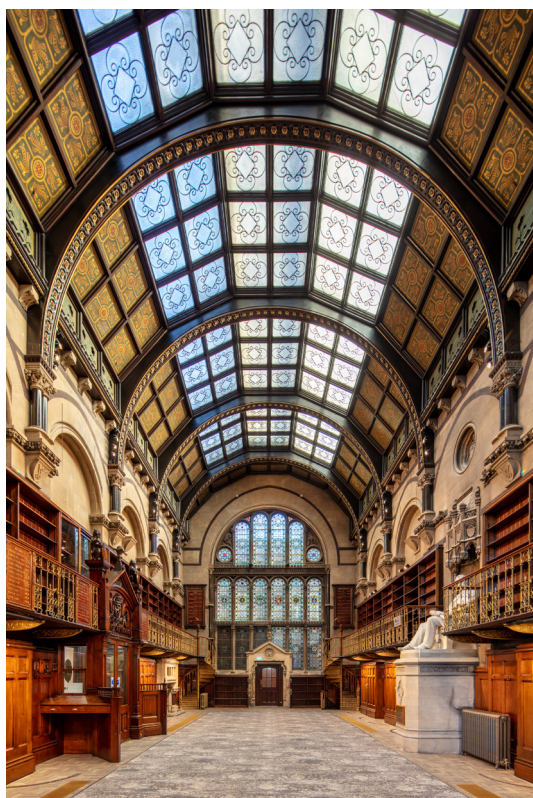
Neville Hall - Wood Memorial Hall