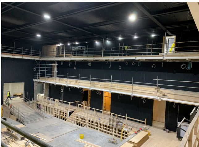
MACQ - Stage Area