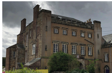
Chorister School, Durham

With these such projects, along with the many other commissions already planned for the rest of the year and beyond, the future of HL's Building Surveying Department looks bright.