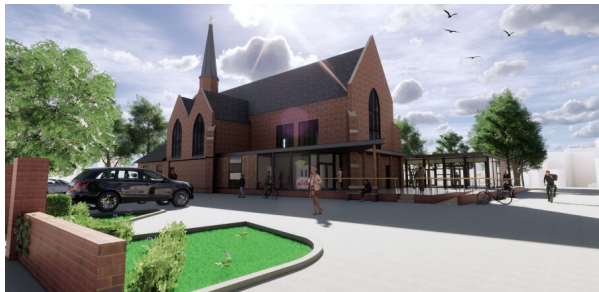
St Georges Church Extension Visuals