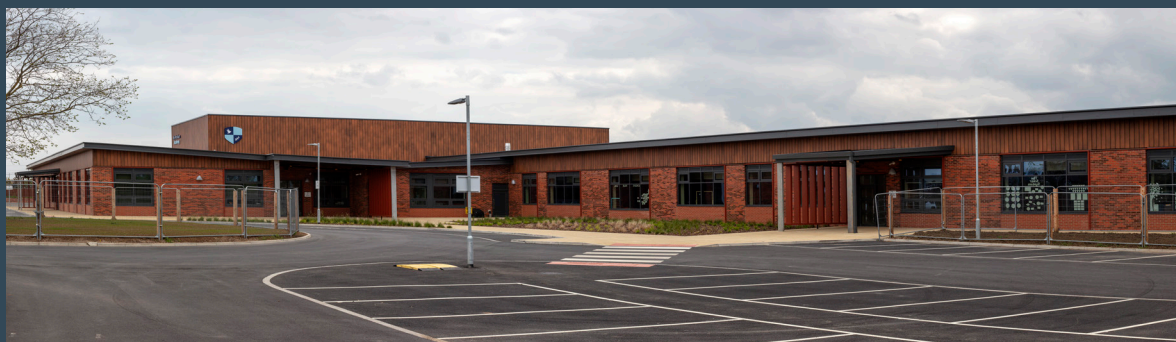
Mo Mowlam, Redcar

This project along with the Discovery Special Academy in Middlesbrough, which is just about to start on site, adds to HL's already extensive specialist education portfolio.