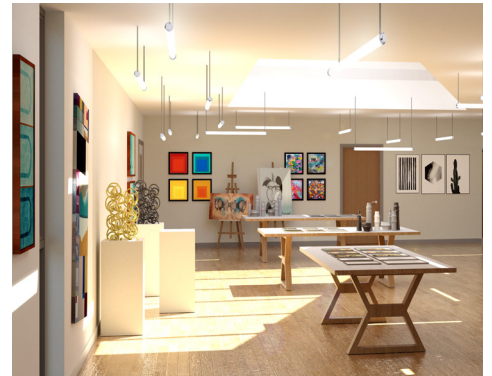
Dame Allan's School Art Room Visual

HL is currently working with Dame Allan's Schools in Fenham to deliver their new £8million development of the North End of the Schools. The new two storey building will provide a multi-functional art exhibition space, 16 classrooms, three new physics laboratories, as well as staff offices, storage and toilet facilities. Contract tenders have now been returned with a planned start on site date of July 2021.