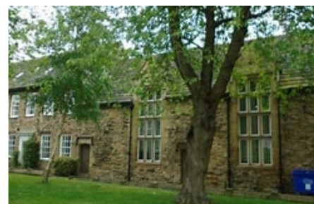
Divinity House, Durham