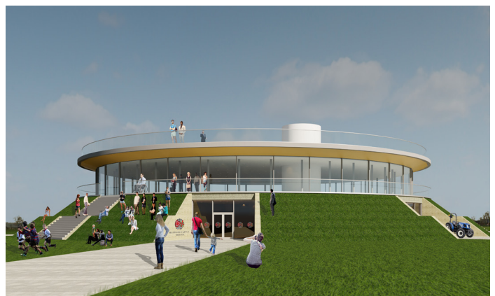
Sports Pavillion Visual

The school's ambitious design and plans have now been submitted for planning approval to Durham County Council which will see the new standalone building set in the sports fields. The building will offer modern changing facilities for staff, pupils and visitors at ground level with a 360 degree viewing area for up to 200 people available at first floor level. Other facilities within the design include a reception area and office space along with accessible changing and separate toilet facilities.