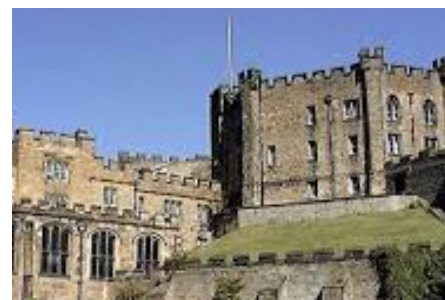
Durham Castle, Durham