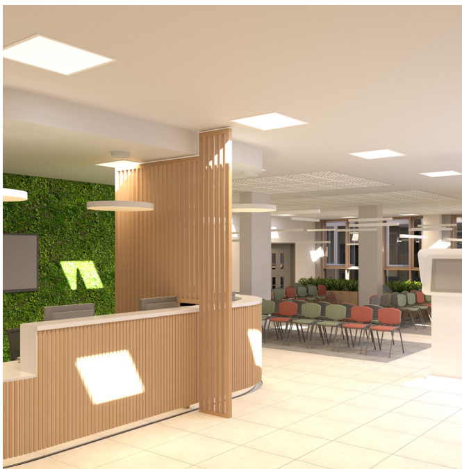
Kidbrooke - 3D Visualisation