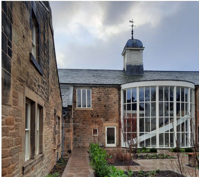
The Coach House - Completion Photo