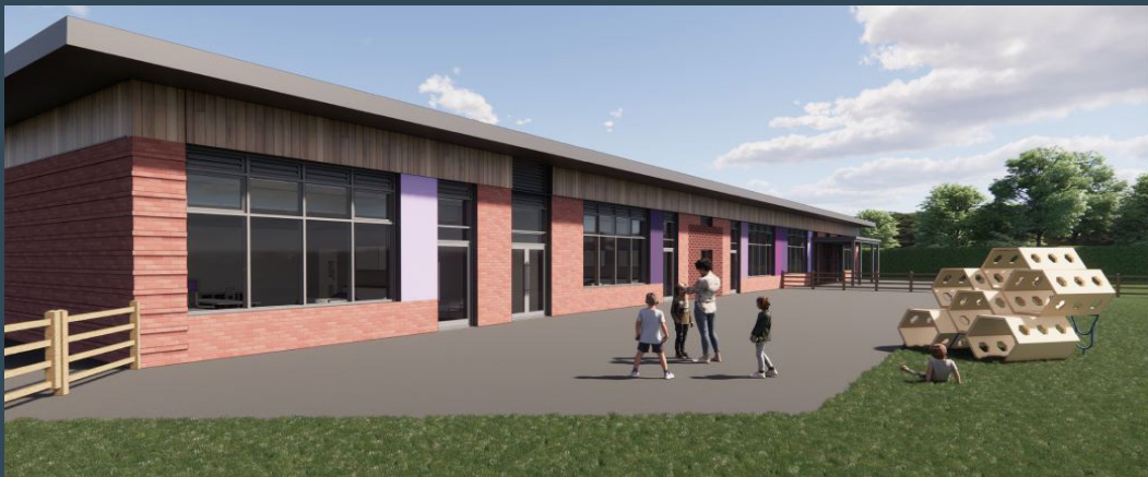
Discovery School - 3D Visualisation

Formal planning permission has been submitted to Middlesbrough Council, with a decision expected in December 2020.