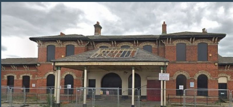
Redcar Central Station

Designs will create a vibrant destination hub for those arriving and departing by train or public transport to and from Redcar. The designs for the space will give visitors access to an interesting mix of retail, leisure, bars and business facilities.