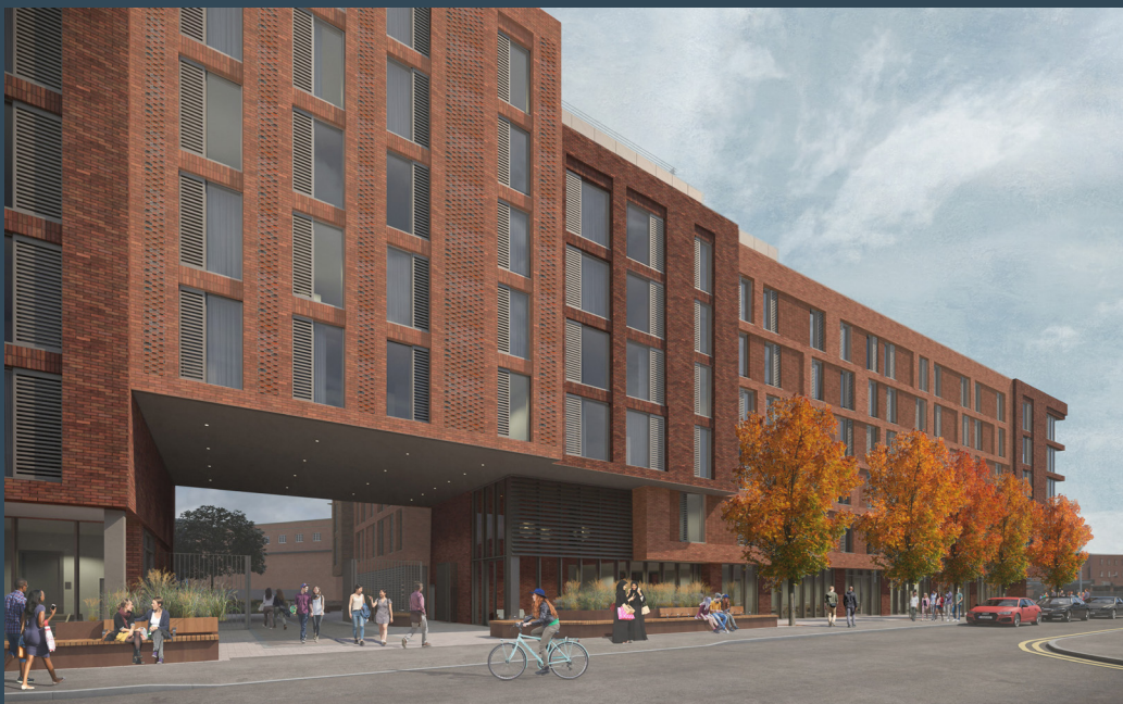
Student Accommodation Leeds - 3D Visualisation

The development will also provide studio and gallery space for emerging local artists on the ground floor, which will be managed by local award-winning non-profit organization East Street Arts.