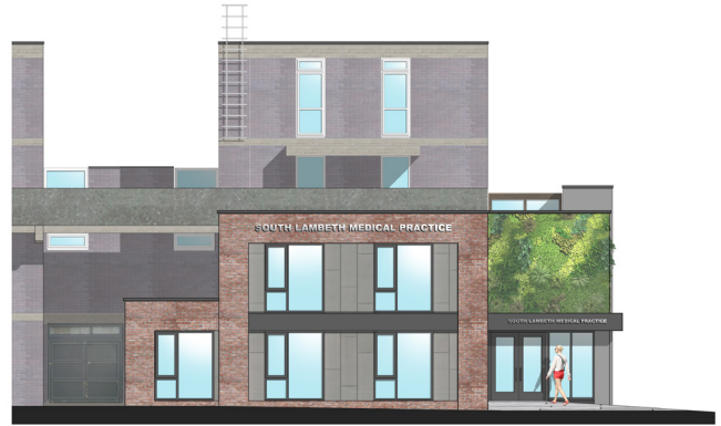
Nine Elms - External Elevations

A contractor is now on board and we are looking forward to developing the projects.