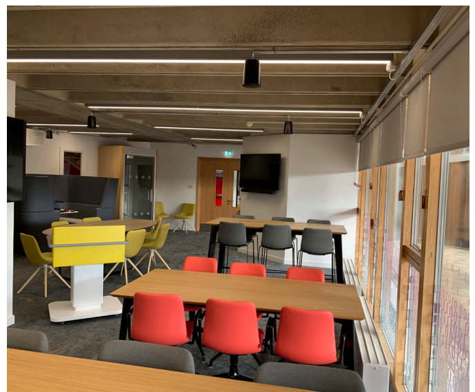
University of Sunderland - Completion Photo

We were delighted to be working with Identity Consult, JH Partners, Roche and Robertson Construction to design and deliver this integrated hub.