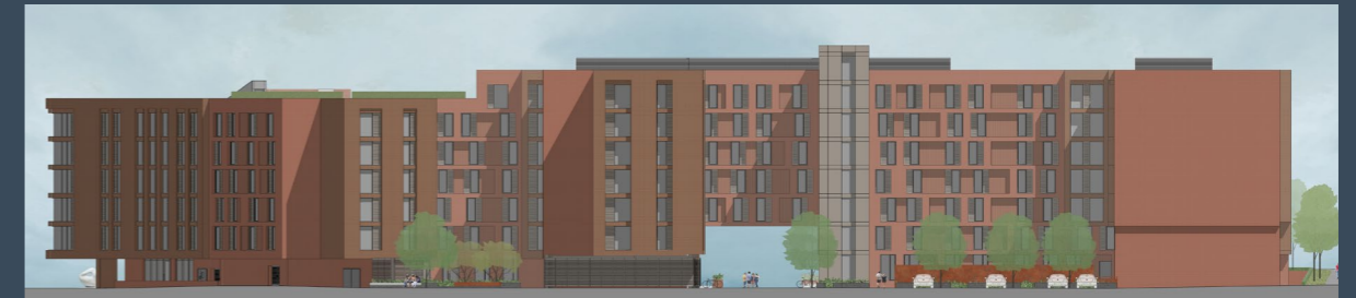
Leeds Alumno - Artists Impression

The design is the result of extensive consultation with Leeds City Council and other stakeholders including East Street Arts and The Henry Moore Foundation. Artist students will also be involved by creating an active street frontage to the ground floor.