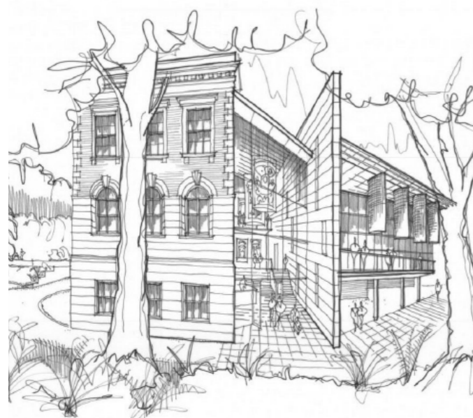
Redhills - Exhibition/Conference/Meeting Facilities Impression