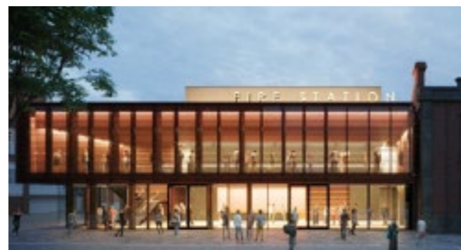
Sunderland MAC Theatre Image Courtesy of Flanagan Lawrence

Work re commencing on the Sunderland MAC theatre, the steel frame taking shape with Brims making good progress. The New theatre has HL as the Design build Architects for the contractor with Flanagan Lawrence as concept Architects