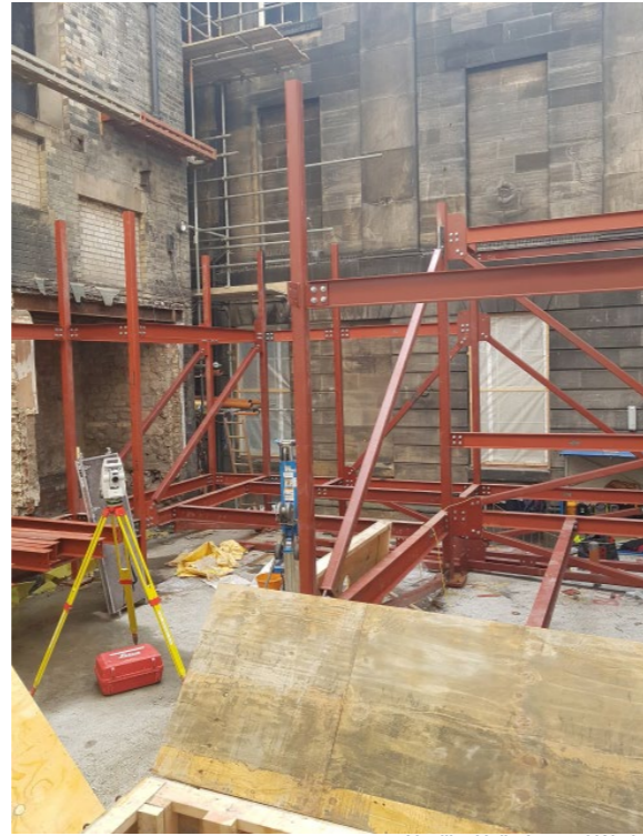
Neville Hall - Internal Works

HL are delighted that the conversion works have recommenced at their Neville Hall Project in Newcastle, with Brims Construction back on site. Neville Hall which is a Grade II* listed building and situated on Westgate Road in Newcastle and was built in 1869 – 1872. The current project for the Common Room of the North using Heritage Lottery Funding, will see this historic building become a centre for careers in Engineering. The project has both new build elements and the complete overhaul and restoration of this fabulous building. When finished the building will have conference, bar, office and lecture and library facilities. HL interiors have been working with the client Liz Mayes to create the right ambience to go with the educational ethos of the building.