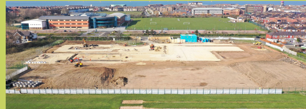
Mo Mowlam Academy - Ground Works

The school's design creates two distinctly separate teaching spaces for primary and secondary pupils. Pupils will have access to a multitude of internal and external learning experiences, that will engage and develop confident individuals who are positive about who they are and what they can achieve, creating successful, enthusiastic and motivated learners.