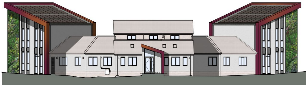
Proposed South East Elevation (front)

We are looking forward to the next chapter in the development of the project and seeing the project start on site later this year.