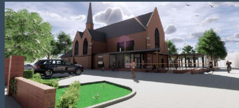
St George's Anglican Church - 3D Image

The proposed extension will contrast with the existing building and feature large areas of glass. Its design will also support one of the church's aims of becoming energy efficient and ecologically friendly through the incorporation of sustainable technology throughout to reduce the buildings energy consumption.