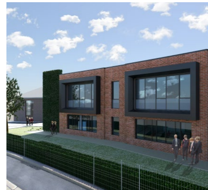
Dame Allens - 3D Image

The proposals are an exciting additional to the facilities at Dame Allan's Schools, providing a new Arts Centre, Science Labs, Sports facilities and general teaching spaces. The design incorporates a living wall to the main elevation to complement the landscaped streetscape.