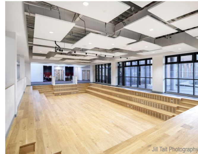
RGS - Agora