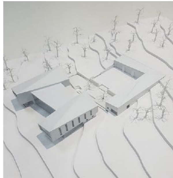
Fold House - 3D Model

HL have enjoyed working with the client to develop a House under the paragraph 79 planning legislation. The design has taken the form of a Northumberland Farmhouse and modern metal barns to create an inspirational design. The scheme has also taken full advantage of the latest environmental innovation methods, one of which is the storage of heat in the ground through an earth bank which will then be displaced back through the house. This design will set new standards of energy efficiency and self-generation and allow the effortless incorporation of the latest technologies which seek to push the boundaries of knowledge.